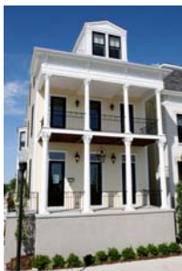
Model 3000-I Site 1333

This model represents true elegance in New Town. This three-story Galt House is inspired by an architectural style typically found in urban places such as Chicago. With views from nearly every front room that overlook the Grand Canal with three fountains, this luxury detached townhome is very unique. Plus, you're footsteps away to the first neighborhood center where you'll find Marsala's Market, the outdoor amphitheater, restaurants and more! Elegant wood flooring throughout most of the first and second floor, granite countertops, upgraded appliances and customized cabinetry in the gourmet kitchen. See sales consultant for a floor plan and complete listing of features.