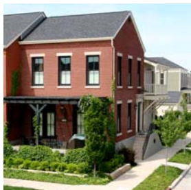
Model 1984-I Site 1022

Enjoy New Town in this fully upgraded 1984 model rowhome. Located at the corner of N. New Town Ave. and Domain Street, you will be within walking distance to many of New Town's attractions, including the amphitheatre and Marsala's Market. Watch a beautiful sunset over the canal from your forecourt, or enjoy a quiet drink in the elegantly landscaped courtyard. This home features easily maintained landscaping, perfect for those who want to enjoy all of the activities New Town has to offer!