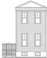
Model 1024-VI Site 2313

Imagine a place where you are within a short walk from civic greens, an amphitheater, a pool club, Marsala's Market, restaurants, bars, neighborhood stores & more. Your imagination is reality with these charming homes ready for early move in. These models represent the best of old and new, creating an inviting place you'll be proud to call home. Get back to living in this wonderful small town setting today!