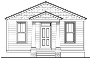
Model 1159-I Site 3310

This delightful ranch cottage, ready for immediate occupancy, is complete with oversized two car garage, egress window, 3/4 bath rough-in, cherry cabinets, patterned countertop, ceiling fans and more. See sales consultant for a floor plan and a complete listing of features.