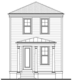
Model 1550-18 Site 8362

This site combines a popular Traditional Neighborhood plan with a prime lake view in the Beach District. Upgrades include special elevation, optional windows, satin nickel hardware and much more. See sales consultant for a floor plan and a complete listing of features.