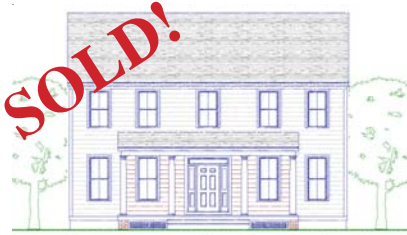
Model 2882-I Site 2906

Imagine a place where you are within a short walk from civic greens, an amphitheater, a pool club, Marsala's Market, restaurants, bars, neighborhood stores & more. Your imagination is reality with these charming homes ready for early move in. These models represent the best of old and new, creating an inviting place you'll be proud to call home. Get back to living in this wonderful small town setting today!