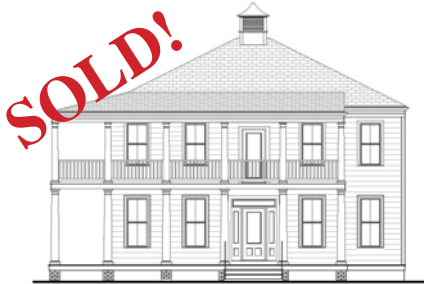
Model 2882 Revised Site 2924

This fabulous house not only features an outstanding canal view, but also has a unique option w/ a wrap around double porch and cupola. Further upgrades include hardwood flooring, 42" cherry cabinets, granite countertops, fireplace and much more. See sales consultant for a floor plan and a complete listing of features.