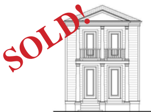
Model 1550-18 Site 3325

This Model 1550 Traditional Neighborhood plan is extremely popular and Site 3325 contains features which make it even more appealing. These features include wood flooring, 42" maple cabinets with crown molding, upgraded paint and custom color, additional windows, upgraded appliances and more. See sales consultant for a floor plan and a complete listing of features.