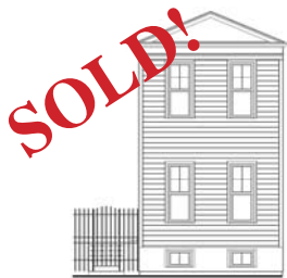
Model 1024-VI Site 2312

This two-bedroom detached cottage offers all the benefits of New Town living at an affordable price. Quality features include two-car garage, 3/4 bath rough-in, Kolbe & Kolbe windows, Certainteed siding and much more. See sales consultant for a floor plan and a complete listing of features.