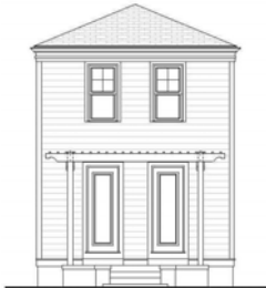
Model 1550-18 Site 8359

Imagine a place where you are within a short walk from civic greens, an amphitheater, a pool club, Marsala's Market, restaurants, bars, neighborhood stores & more. Your imagination is reality with these charming homes ready for early move in. These models represent the best of old and new, creating an inviting place you'll be proud to call home. Get back to living in this wonderful small town setting today!