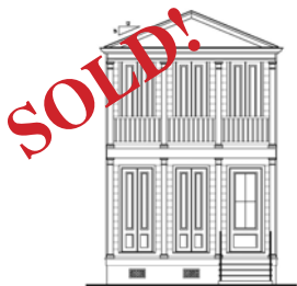
Model 1280 Site 307

This three-bedroom cottage offers all the benefits of New Town living at a great price. Quality features include custom elevation, a beautiful 8' mahogany front door, spacious first floor with 10' ceilings, enjoy the screened deck and much more. See sales consultant for a floor plan and a complete listing of features.