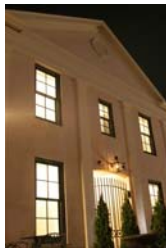
Model 904 II Condo Site 2642 D2

This two-bedroom, two-bath single-level condo offers luxury new urban living at an affordable price. Quality features include 42" kitchen wall cabinets, 9' ceilings, Kolbe & Kolbe windows and more. This particular condo is also equipped with the necessary prewires and phone jacks as well as a pattern countertop and upgraded door hardware. See sales consultant for a floor plan and a complete listing of features.