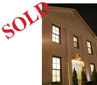
Model 904 I Condo Site 2636 B1

This two-bedroom, two-bath single-level condo is a striking example of low maintenance living at a great price. This home features a one car garage with opener, two ceiling fans, satin nickel hardware, upgraded appliances, custom paint colors, window treatments and more. See sales consultant for a floor plan and a complete listing of features.